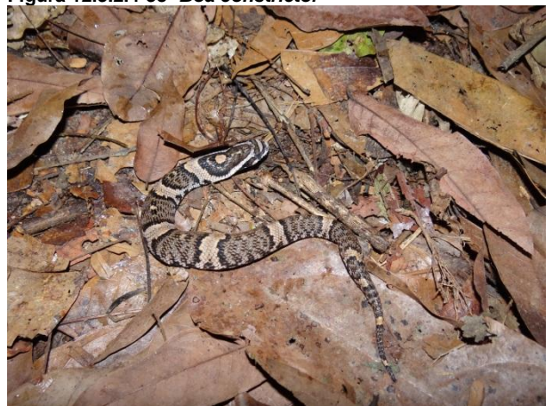
Figura 12.3.2.4-40- Xenodon severus