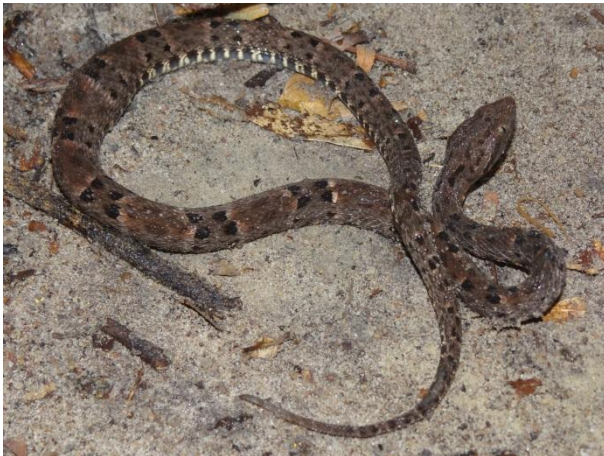
Figura 12.3.2.4-37- Bothrops atrox