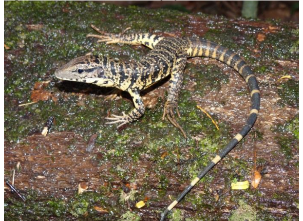
Figura 12.3.2.4-32- Tupinambis teguixim