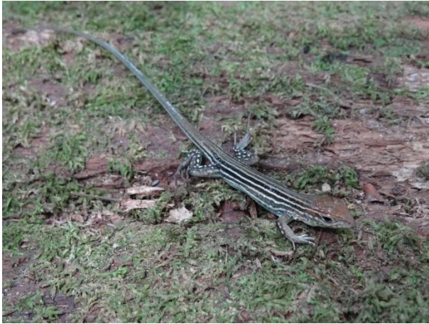
Figura 12.3.2.4-35- Cnemidophorus cryptus