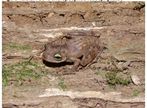
Figura 12.3.2.4-28- Osteocephalus oophagus