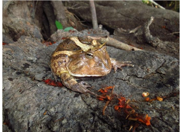
Figura 12.3.2.4-24- Ceratophrys cornuta