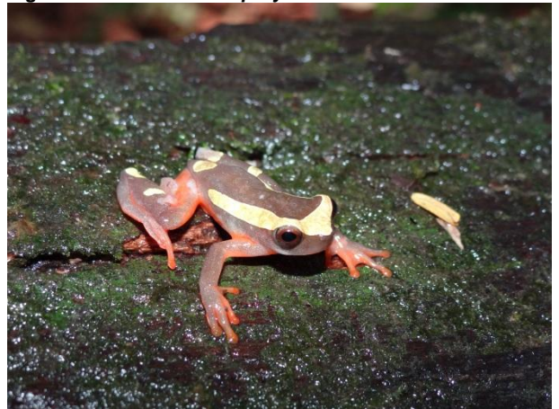
Figura 12.3.2.4-26- Dendropsophus leucophyllatus