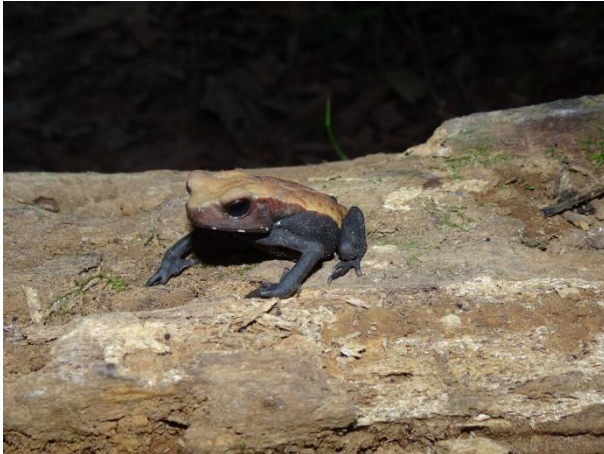
Figura 12.3.2.4-23- Rhaebo guttatus