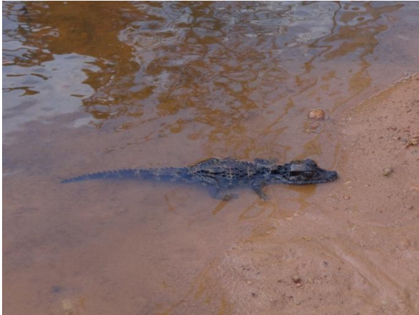
Figura 12.3.2.4-29- Paleosuchus trigonatus