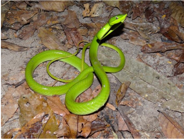
Figura 12.3.2.4-41- Oxybelis fulgidus