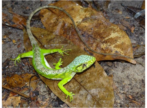
Figura 12.3.2.4-36- Polychrus marmoratus