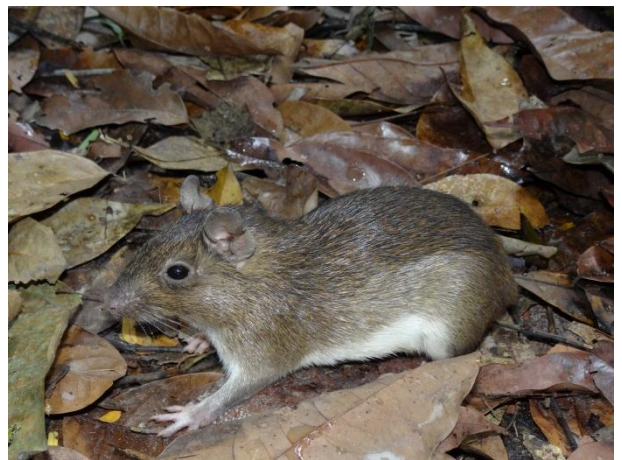
Figura 12.3.2.4-44- Proechimys cuvieri