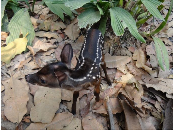
Figura 12.3.2.4-48- filhote provável - Mazama americana