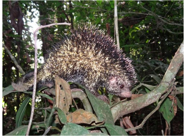
Figura 12.3.242-49- Coendou prehensilis