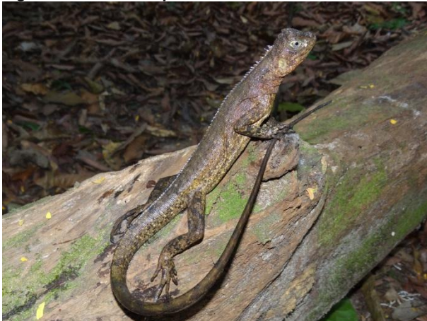
Figura 12.3.2.4-33- Uranoscodon superciliosus