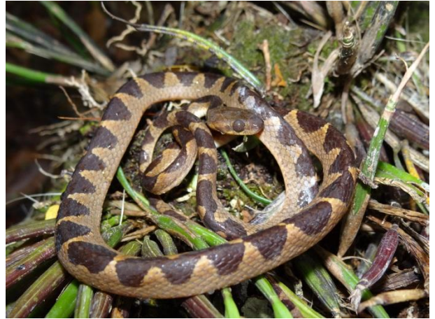
Figura 12.3.2.4-42- Leptodeira annulata