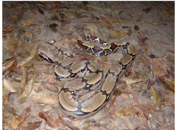
Figura 12.3.2.4-38- Boa constrictor