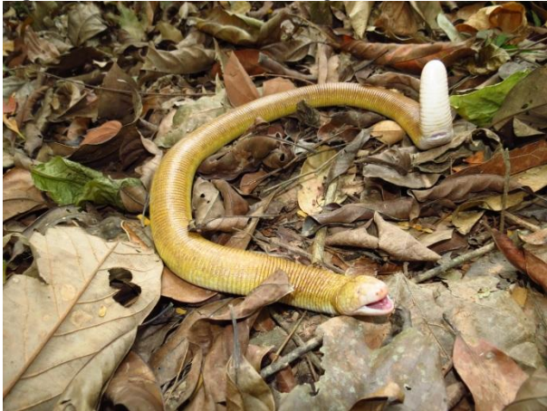
Figura 12.3.2.4-31- Amphisbaena alba