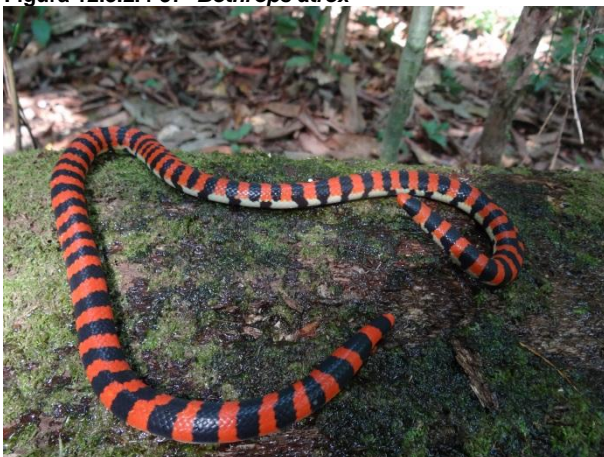
Figura 12.3.2.4-39- Anilius scytale