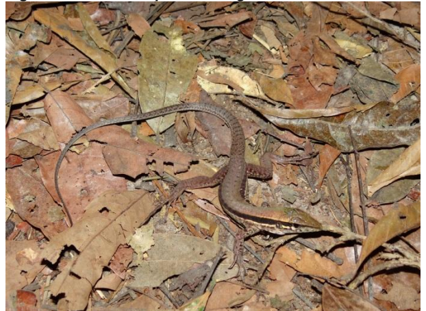
Figura 12.3.2.4-34- Ameiva ameiva