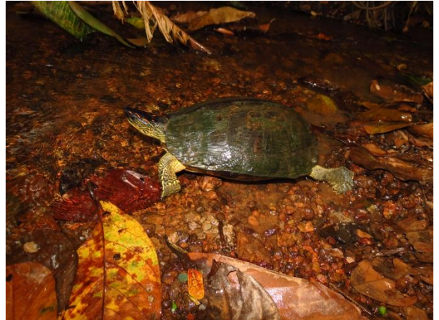
Figura 12.3.2.4-30- Rhinoclemmys punctularia