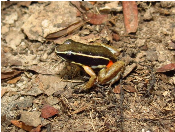
Figura 12.3.2.4-25- Allobates femoralis