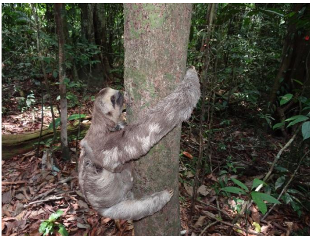
Figura 12.3.2.4-43- Bradypus variegatus